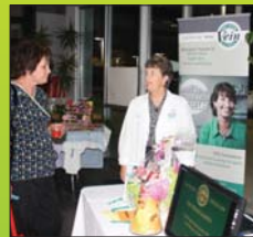
Sponsors attended the event to share their work with the attendees. Thanks to our Sponsors for their support of the McMillen Center.